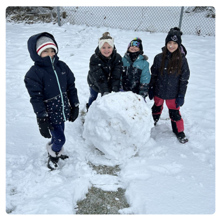
Finally, some fun in the snow!